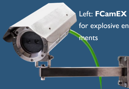
Left: FCamEX for explosive environments

Investment: Join the Ciqurix Family Seeking £700,000 at a valuation of £5.25m to fund the expansion of our company, creating new equity of 12%.