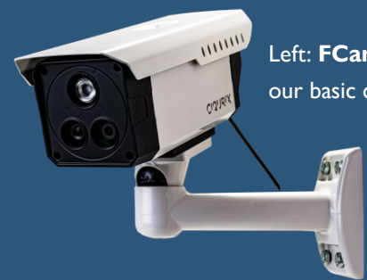
Left: FCamX our basic camera model