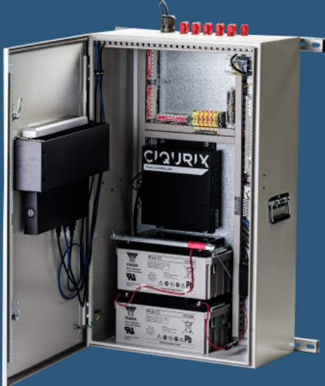
Above: FCam Core Hub