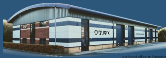
our head office in Paignton

Don't invest unless you're prepared to lose all the money you invest. This is a high-risk investment. Take 2mins to learn more.