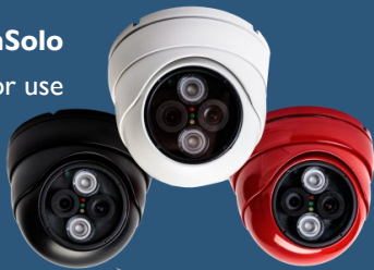
Right: FCamSolo for indoor use